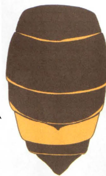
Native hornet abdomen